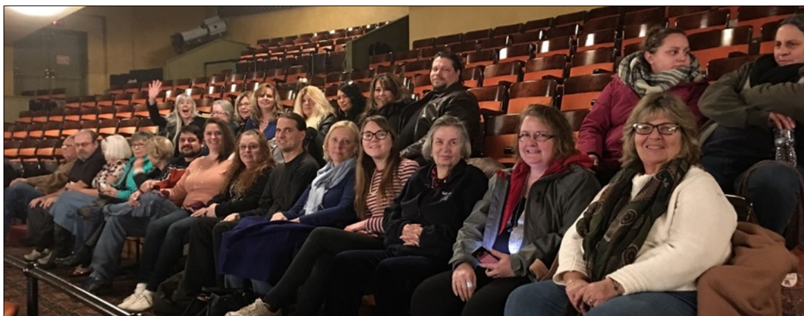
The crew from OGPC awaiting their trip back in time through the music of Decades Rewind .