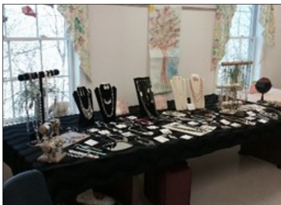
The Premier Designs Jewelry display.