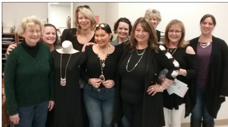
Some of the ladies who attended the Jewelry Party.